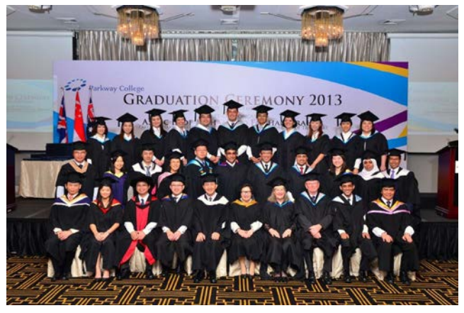
Singapore Graduation Ceremony 2013

Another exciting piece of news for the Singapore students is that from next year we will be offering students from Universitas Gadjah Mada (UGM) in Yogyakarta a so-called "double degree" option, where they will do their own MHA with UGM and then do a number of topics and a thesis with us in Singapore to get a second Masters degree from Flinders. We are expecting 4 or 5 Indonesian students to join us in June next year.