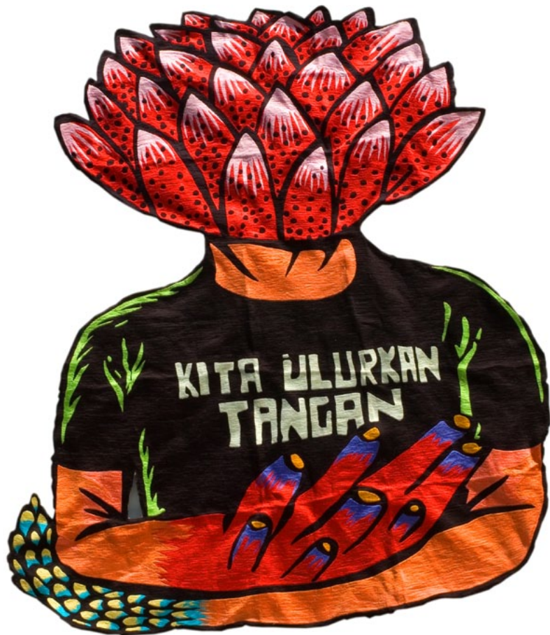
Eko Nugroho, Indonesia, 1977, Kita ulurkan tangan (We extend our hands), 2011, Yogyakarta, fabric, wire, rayon thread, machine embroidery, 126.0 x 110.0 cm; Gift of the Art Gallery of South Australia Foundation 2012, Art Gallery of South Australia, Adelaide, © Courtesy the artist

The theme for the workshops and film competition is Families at Work and Play .