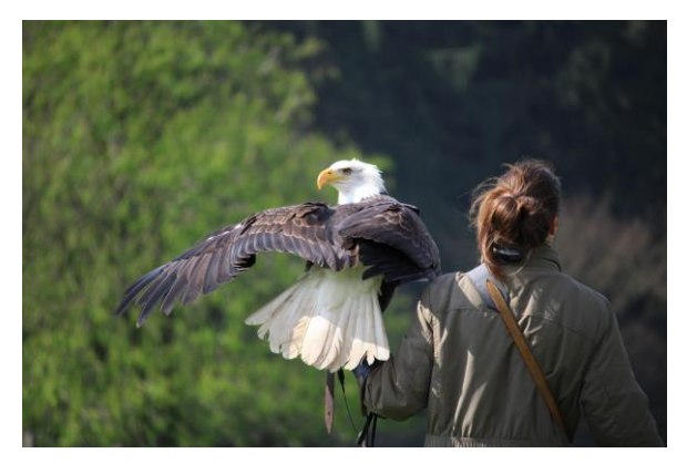
I just included this picture cause eagles are cool