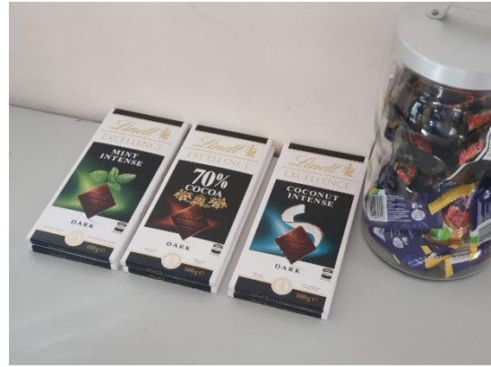
THIS IS MY STUDY SPACE

how you study. A good study space is physically comfortable, has everything you need to study, low distraction, uncluttered and uniquely you.