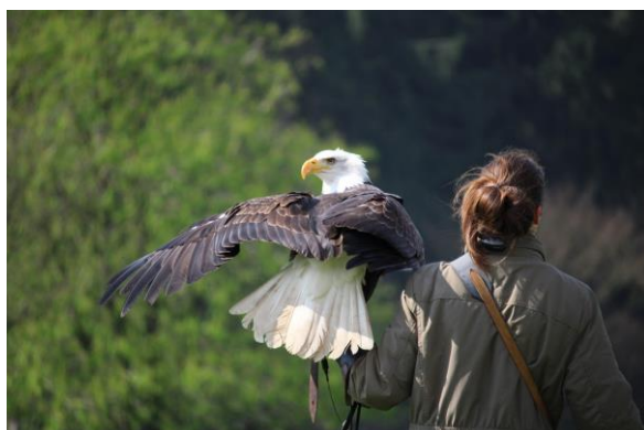
I just included this picture cause eagles are cool