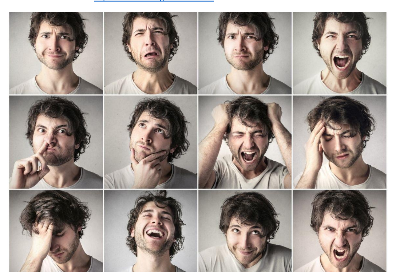
Are you conserving enough mental energy to be successful at the change you are trying to make? Establishing new habits requires mental energy. Look at other aspects of your life where you might be able to conserve or increase your overall mental energy. For example, getting more sleep or reducing your workload.

Do you know how to manage difficult emotions? Sometimes we are derailed from our efforts to be healthy by unpleasant emotions. Develop new strategies for managing unpleasant emotions such as mindfulness meditation - https://www.smilingmind.com.au/